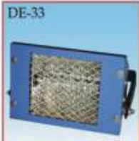
DE-33 Halogen Lamp (500 W)