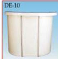
DE-10 Reception Desk