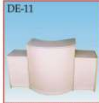
DE-11 Deluxe Reception Counter