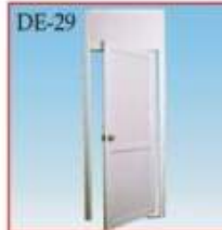
Lockable System Door