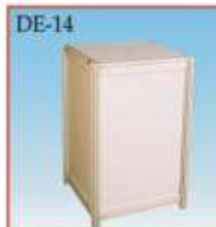
DE-14 Podium (50 x 50 x .75 mt)