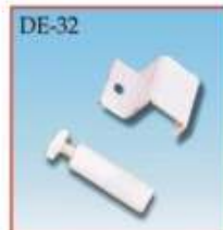
T-bolts / Photo-clip