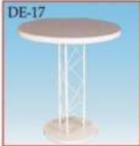
Round Table Wood