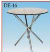
DE-16 Round Table Glass