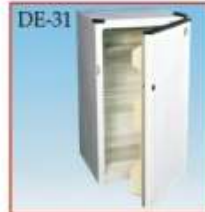
Fridge 100/165 Ltr.