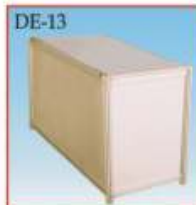
DE-13 Podium (50 x 1 x .75 mt)