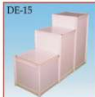
DE-15 Step Podium