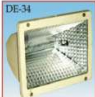
DE-34 Halogen Lamp (1000 W)