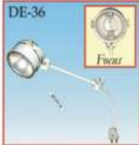
DE-36 150 W Halogen Light