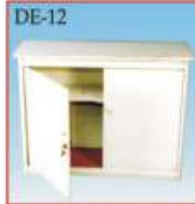
DE-12 Lockable cupboard