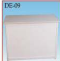
DE-09 Reception Counter