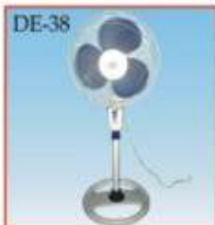
DE-38 Pedestal Fan