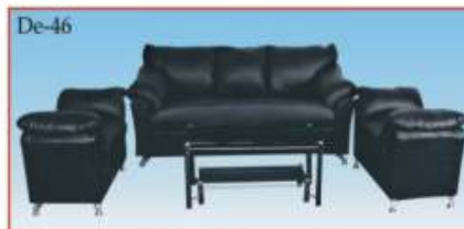
Sofaset (five seater)