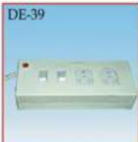
DE-39 Power point (socket)