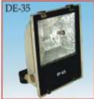
DE-35 Metal halide