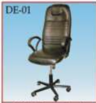
High Back Chair