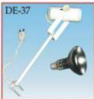
DE-37 Bulb Spot